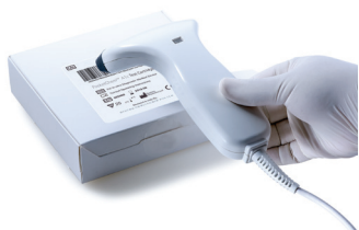
Convenient Barcode reader

Boronate affinity methodology is widely recognized as interference-free from Hb variants.